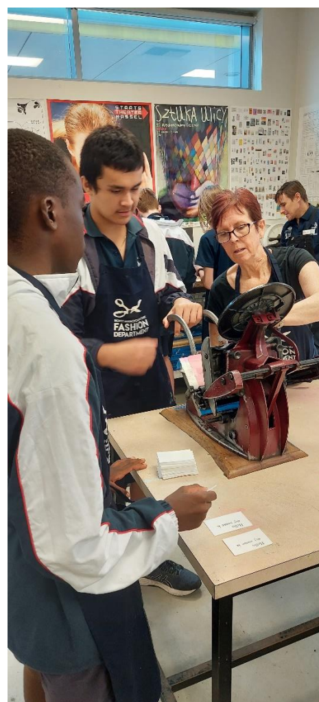
Arts and Media TAFE Career Taster

Encouraging a sense of social responsibility, the school promotes community service initiatives. Students participated in a range of activities, from local clean-up projects to charity fundraisers. The Year 10 Community Service Program saw students contribute over 1,000 hours of service, fostering a strong sense of community and civic duty.