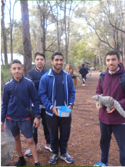
Setting traps for feral cats and foxes.

On Wednesday July first, my class and I went to the Perth Hills Discovery Centre. I was very happy because I saw my friends and I laughed. I also saw new animals like the chuditch and echidna. I saw some new trees and plants and I listened to some music on the bus. I played games with my friends and we saw birds when we ate our lunch.